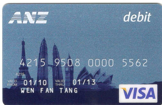
ATM card of Bank ANZ

Foreign distributors may opt for having their commissions temporarily kept in HTE Vietnam and withdraw their funds in cash when they visit HTE Vietnam.